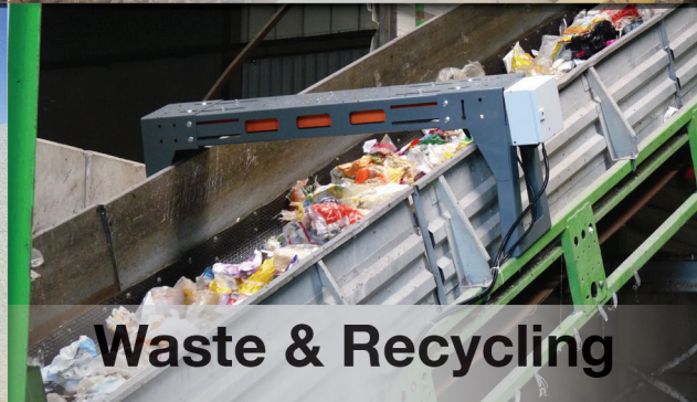
Waste & Recycling