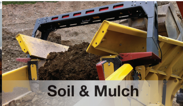
Soil & Mulch